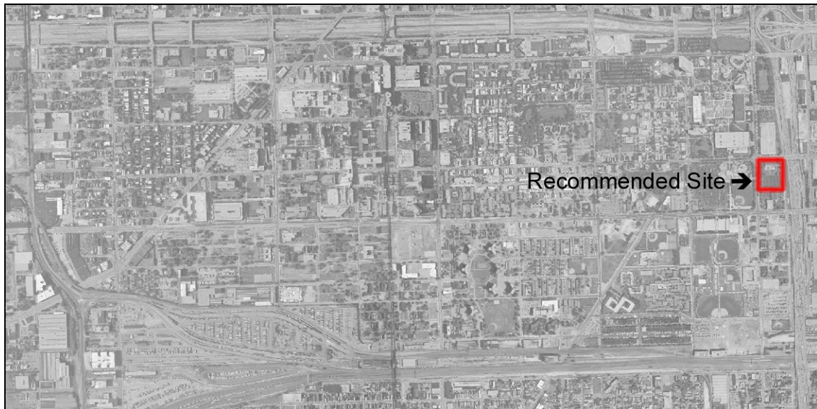
Exhibit 7: Example of a Site Identification Map in the Site Selection Report .